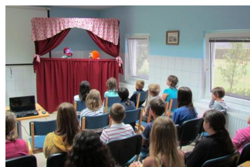
Vesela novica gathers children for summer camps each year to spread the Gospel among those who have never heard.