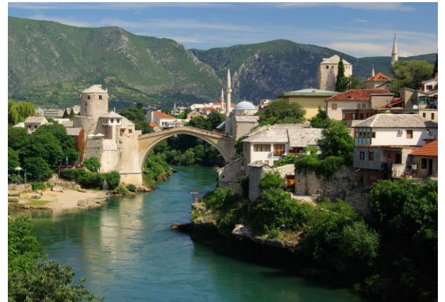
Mozaik mission trip planned, Banka luka, Jace, Sarajevo, and Mostar.

We are excited to have a team of eight people planning to travel to Bosnia in Herzegovina 2-7 October. The team has arranged to visit churches and pastors in Banja Luka, Jace, Sarajevo, and Mostar. The goal of this mission trip is to encourage local workers, build our relationships after a Covid forced break, to learn about ministry opportunities and needs among our neighbors. We are always encouraged to connect with pastors serving in difficult situations. Please pray for safety and that we can be an encouragement.