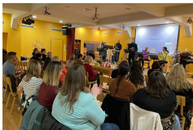
Vesela novica gathered children's workers for a wonderful seminar to help prepare workers among children.

Partner with Mozaik Missions and impact the nations.