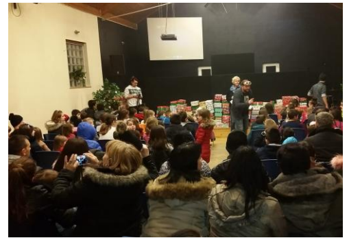
Children in Sarajevo

Please pray for the team as they travel and serve, also consider partnering with them to bring the Gospel to many children. Give to Mozaik and mark your gift "Sarajevo children", it will go 100% to things the children need.